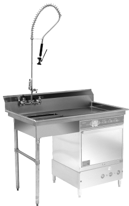
48" Undercounter dishtable with Pre-Rinse